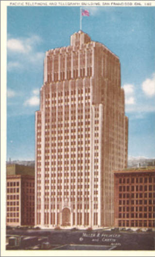
SAME IMAGE, COLOR LITHO BY PACIFIC NOVELTY, #1-102