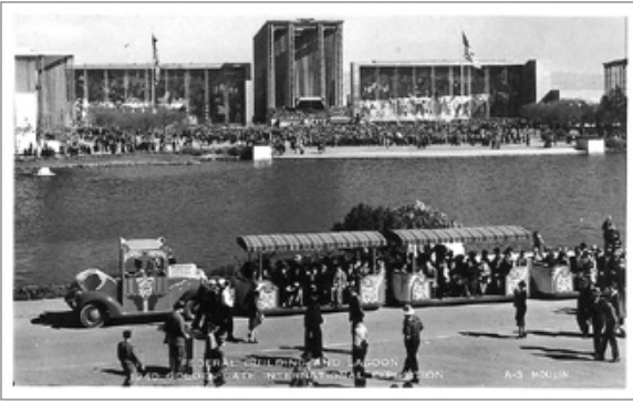
A-3 FEDERAL BUILDING AND LAGOON AT GGIE.