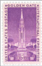
U.S. #852 1939 3¢ GGIE, bright purple