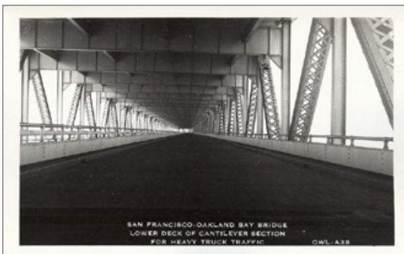
A38 LOWER DECK OF CANTILEVER SECTION OF BAY BRIDGE, ALMOST READY FOR TRUCK TRAVEL.

Gaining momentum, Owl Drug Co. installed a store in Los Angeles in 1894, another in Oakland in 1896, and in July 1904 a second San Francisco store was opened on Geary Street. Rebuilding after the 1906 earthquake and fire, the chain had five San Francisco stores by March 1909, and consistently grew during the following 20 years. In 1931, a year after Owl Drug Co. had been absorbed by the Louis K. Liggett Co., there were 130 Owl drugstores covering the Pacific Coast, ranging from San Francisco to San Diego, Portland, Seattle, Spokane and Salt Lake City. Liggett’s parent, United Drug Co. of Boston,