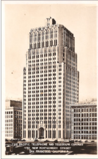
RP, POSSIBLY FOR DEDICATION, USED 1930

The PT&T Building is worth a stroll south of Market. Take refreshment at the Palace to see if and where The Pied Piper has been rehung... then amble down to 140 New Montg'y, stopping to glance up every few yards... a tour of the magnificent lobby, should there be ac-