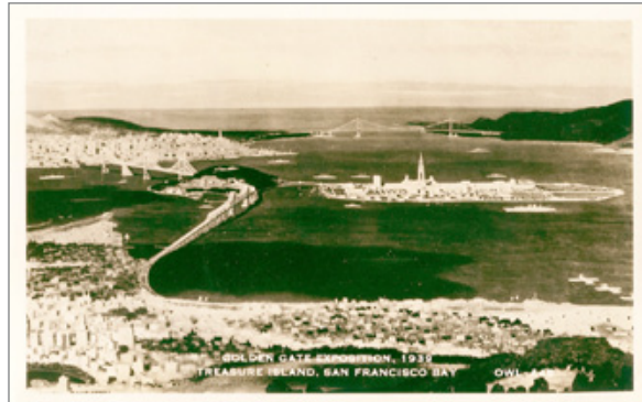
A48 ARTISTIC RENDERING OF GGIE AND NEW BAY BRIDGES BY CHESLEY BONESTELL, ©1937.