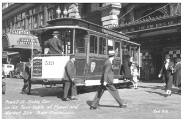
OWL DRUG CO., MARKET AND POWELL, FLOOD BLDG. C. 1934.

And the photographer? The white captions on OWL cards display the same size and style of gothic typography seen on real photos by Gabriel Moulin (1872-1945). A good example is the GGIE view titled "Federal Building and Lagoon, A-3, Moulin" captioned and numbered like the OWL series. Additionally, OWL postcards A45 and A48 show views