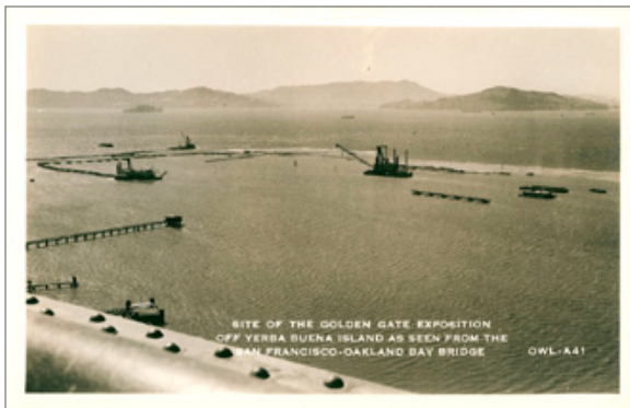
A41 DREDGES AND BARGES DURING FIRST STAGES OF CREATING TREASURE ISLAND.