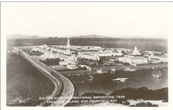
A45 ARTISTIC RENDERING OF GOLDEN GATE INT’L EXPO BY CHESLEY BONESTELL, ©1937.

Contributors: FRANK STERNAD, KATHRYN AYRES