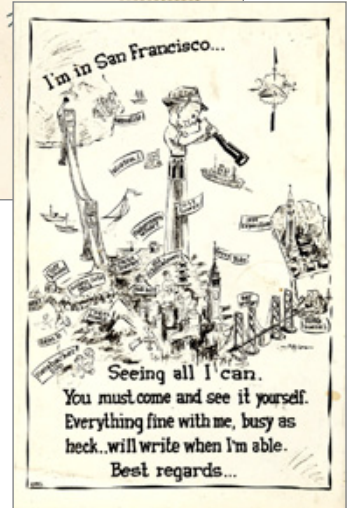
CARTOON POSTCARD SIGNED PETE LONG PUBLISHED BY OWL DRUG CO. AS GGIE PROMOTIONAL.