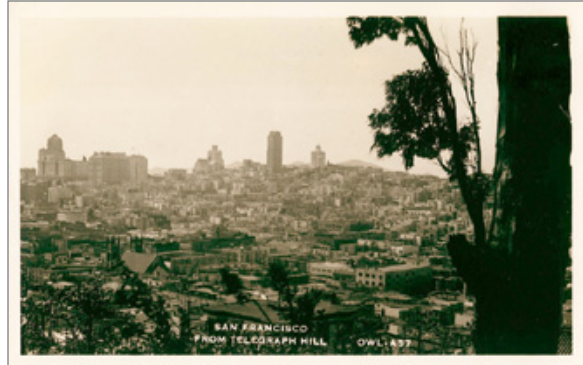
A57 VIEW OF SAN FRANCISCO FROM TELEGRAPH HILL, HOTELS ON NOB HILL AT LEFT.