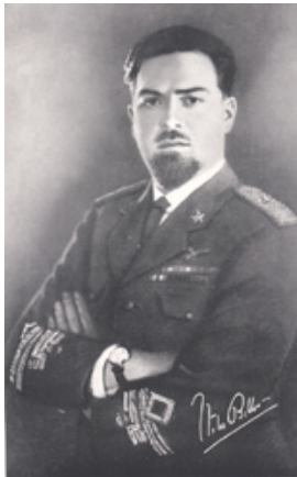
BALBO: DISTINGUISHED OFFICER – DASHING HERO

To celebrate the 10th anniversary of the Italian Air Force, Balbo planned the largest and longest flight