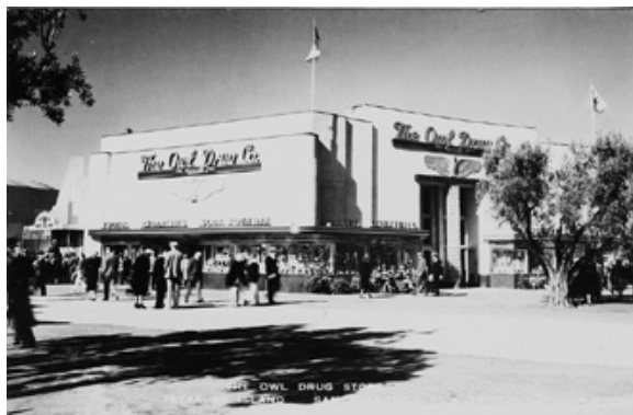
A-77 ULTRA MODERN OWL DRUG CO. STORE ON TREASURE ISLAND DURING GGIE.