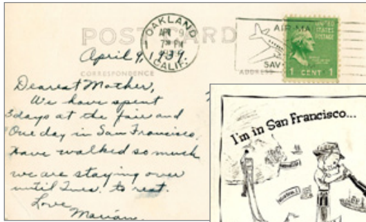
TYPICAL FAIRGOER’S MESSAGE ON OWL PHOTO POSTCARD, MAILED APRIL 1939.