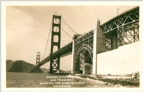
A102 SOUTHERN ANCHORAGE OF GOLDEN GATE BRIDGE ARCHING OVER FORT POINT

old fossils and mossbacks that are resisting modern merchandising would make more headway clearing the seals off Cliff House rocks than compelling the OWL to join their gang.” Druggists not driven out of business during the trade war were the ones that came to their senses and learned to survive by competing outside the loss leader arena.