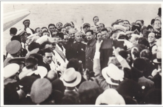
BALBO, THE HERO, GREETED BY MUSSOLINI AND CROWD

to Rome. We also saw desirable but far more “common” souvenir envelopes mailed from the World’s Fair.