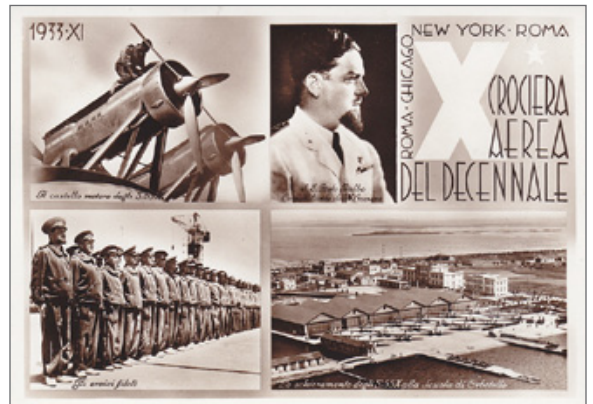
MULTIVIEW SHOWS PLANES AT ORBETELLO