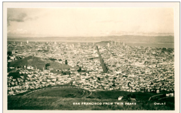
A-1 VIEW FROM TWIN PEAKS SHOWING YERBA BUENA ISLAND AND CONSTRUCTION OF THE BAY BRIDGE.

The earliest pictures date from 1936. OWL image A-1, taken from Twin Peaks, shows the Bay Bridge well under way, but no evidence of Treasure Island. When the 400-acre artificial landform did begin to rise from the bay in 1936, the OWL photographer captured a rare image of the activity (A41). Images 20 and A38 show final preparation of the Bay