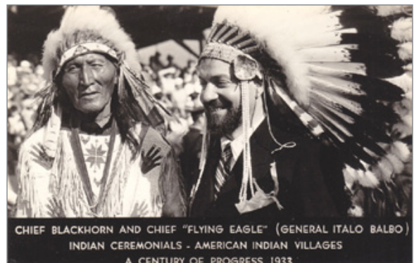
CHIEF BLACKHORN AND CHIEF "FLYING EAGLE" (GENERAL ITALO BALBO) INDIAN CEREMONIALS - AMERICAN INDIAN VILLAGES A CENTURY OF PROGRESS 1933

AT THE FAIR, ANOTHER FEATHER FOR HIS CAP