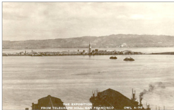
A-76 VIEW OF TREASURE ISLAND FROM TELEGRAPH HILL DURING 1939-40 WORLD'S FAIR.

Owl Drug Co. succeeded in having a huge presence at the fair in the form of a magnificent drug-store. Postcard A-77 shows the façade of their Streamline Moderne building, with giant sculpted owls decorating the walls, and names of cities that boasted Owl stores inscribed above the display windows. A quote from the GGIE Official Guide Book