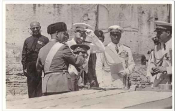
IL DUCE AWARDS NEW CAP AND TITLE

After his return to Italy as a great national hero, Balbo was sent to be the governor of the Italian colony of Libya. It was a successful appointment, and