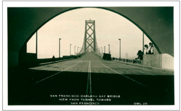
20 VIEW OF DOUBLE SUSPENSION SECTION OF BAY BRIDGE FROM YERBA BUENA TUNNEL.

controlled the Rexall brand, and over the next few years signs on Owl stores were altered to read, “The Owl Drug Co./The Rexall Store.”