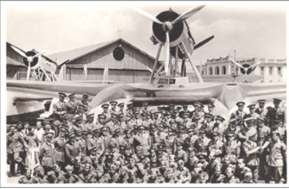
TROOPS THAT MAN THE 25 PLANES

Stops en route were Amsterdam; Derry in Northern Ireland; Reykjavik, Iceland; Cartwright, Labrador; Shediac, New Brunswick; and Montreal, Québec before landing on Lake Michigan on July 15, near the Century of Progress fairgrounds.