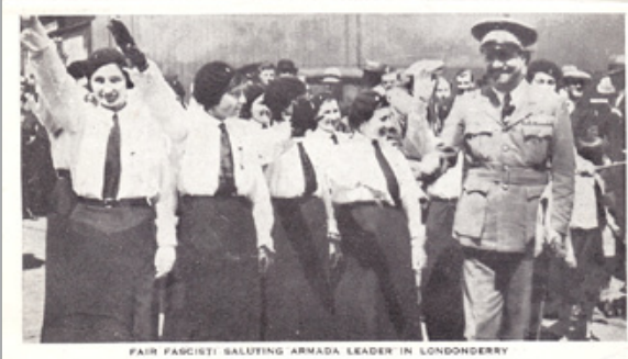
FAIR FASCIST! SALUTING ARMADA LEADER IN LONDONDERRY