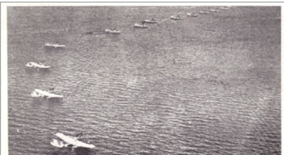
ITALY'S AIR ARMADA RESTING ON IRISH SEA