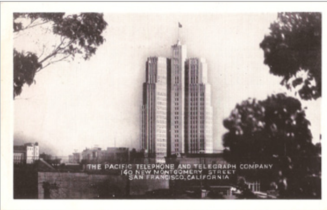
PRINTED RP LOOKALIKE, BACKGROUND APPEARS AIRBRUSHED AWAY

cess... and then strike out to glimpse the backside view from the raised level of the Yerba Buena Gardens. If you see postcards for sale (or gratis), get me one, too, please. —LB