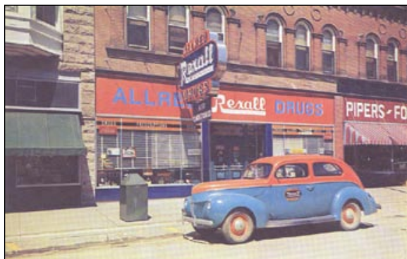
ALLRED REXALL, CORYDON, IOWA