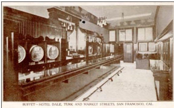
BUFFET—HOTEL DALE, TURK AND MARKET STREETS, SAN FRANCISCO, CAL.

The Hotel Dale Buffet looks like a prime Market Street free lunch establishment with beer kegs at the ready, and a side bar for extra eating and drinking elbow room.