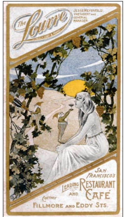
ADVERTISEMENTS FOR THE LOUVRE, INCLUDING INTERIOR VIEWS BEFORE AND AFTER THE EARTHQUAKE AND FIRE