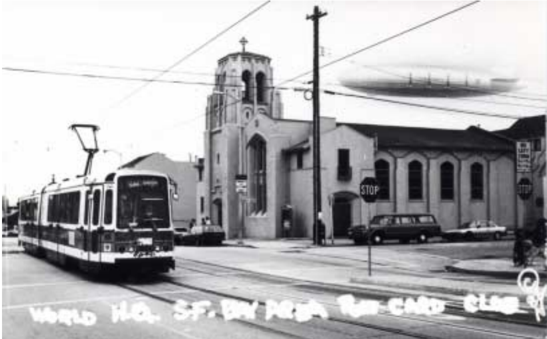
From the 1980s comes this tongue in cheek montage real photo of the church in which we met, "World HQ S.F. Bay Area Post Card Club."