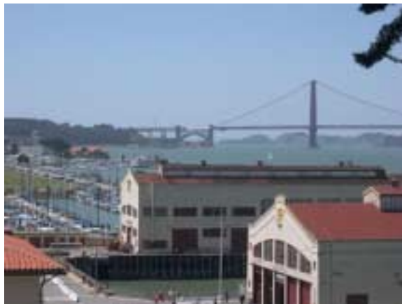
Fort Mason: the view behind our current meeting place.

stamp groups as venues for finding collectible cards and for spreading the word about the fascination of postcards. Our club demographics are wide ranging. Although most of the membership lives in Northern California, we have club members in the southern part of the state, across the continent and in Europe. Estimated ages of participating members spans seven decades—from the thirties well into the nineties. No marriages caused by postcards have been reported, but more than one romance has blossomed and matured over the boxes at club meetings.